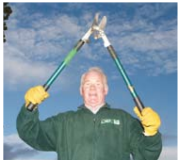
BTCV Green Gym celebrated its 10th anniversary this year.

During the year, BTCV involved over 115,000 individuals in diversity-related work and engaged with 25,000 people from black and minority ethnic backgrounds. 44% of all people involved in our activities came from under-represented communities.