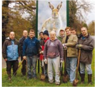
Fermanagh Conservation Action Team is a group of long term unemployed people involved in projects helping local wildlife and tackling the impacts of climate change.

Environmental volunteering is also highly inclusive. Exposure to nature breaks down social barriers and provides common ground for interaction between diverse groups. Marginalised groups, including black and minority ethnic communities, have traditionally been seen as less likely to engage with the environment, but BTCV's work over the last few years has challenged this assumption.